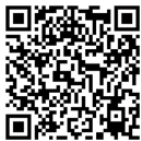
T800-EX 3D demo