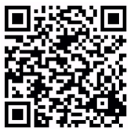
V110 3D Demo